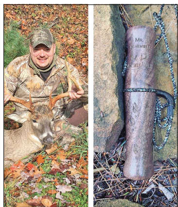
MILLCREEK VALLEY GAME CALLS MR. NOVEMBER GRUNT & BLEAT DEER CALL